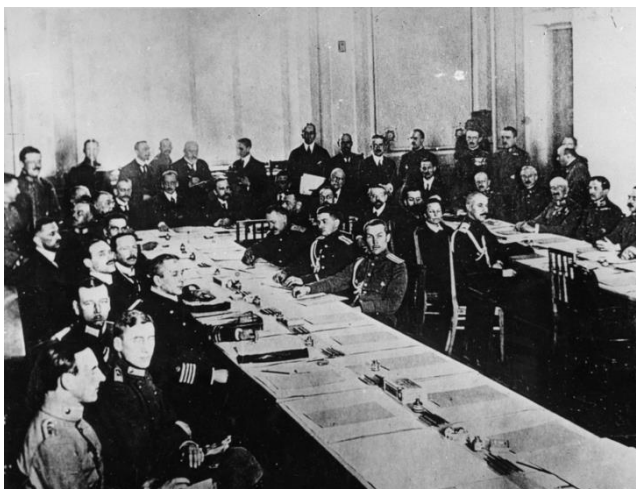
1918, Januar - Februar