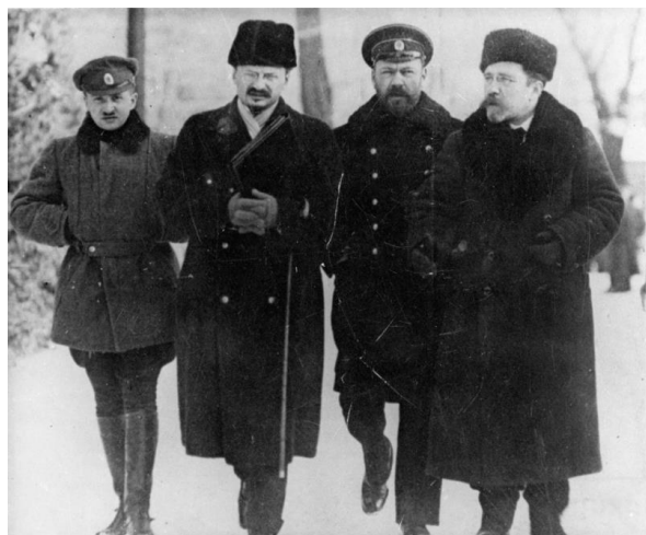
Bild 183-R15113 Februar 1918

Our Featured Documents series reprises with “ The Treaty of Brest-Litovsk ”, dedicated to the negotiations for peace between Russia and the Central Powers, following the October Revolution. In the 100 th year anniversary, these records are a powerful testimony of the complexity of the transitions triggered by the First World World. This set of Feature Documents also celebrates the new online portal dedicated to the Weimar Republic (see the News section). Click on the documents to access the exhibition